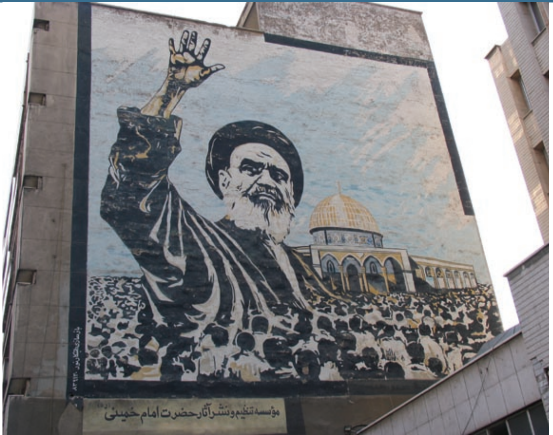
Imam Khomeini towering over the Dome of the Rock.