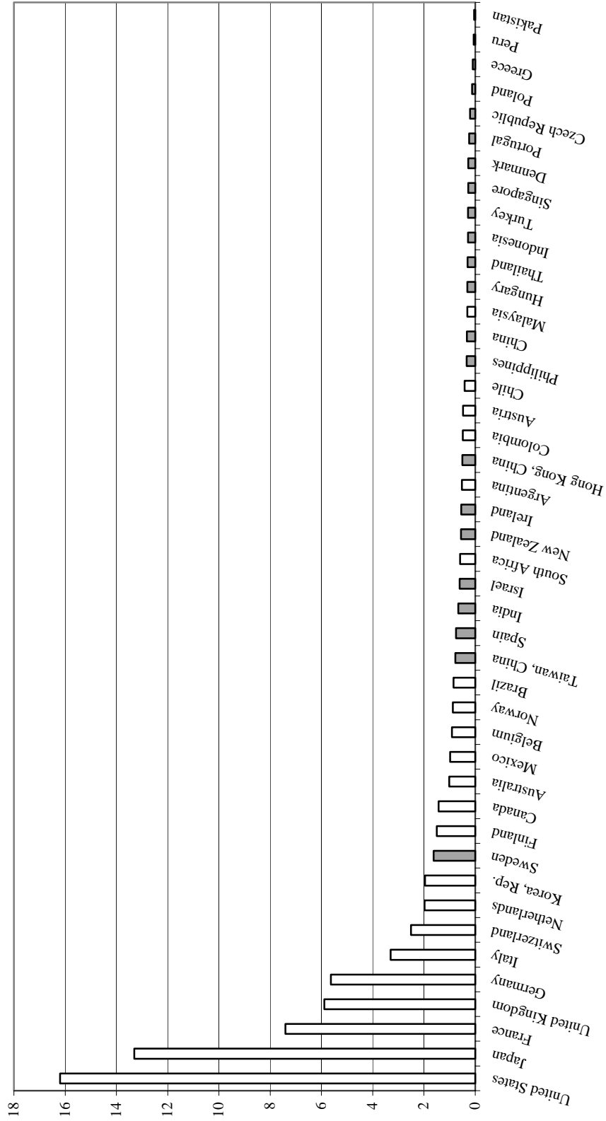
Figure 2. Assets is given by total assets of the largest 100 firms in manufacturing in millions of US dollars.. The figure presents the average assets for firms in each country for 1988-1997. The countries are in descending order.